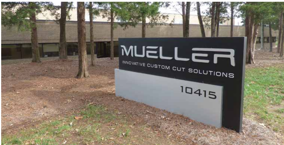
Mueller operates a 134,000 square foot facility in Charlotte, North Carolina

To address the timing issues related to the supply chain, Company C opted to find an alternative fabricator to replace Company B. Company C turned to Mueller for assistance, based on their long-standing relationship and Mueller’s ability to successfully manage similar supply challenges in the past.